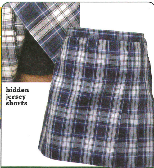
hidden jersey shorts